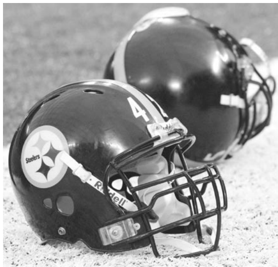
Two Pittsburgh Steelers helmets sit on the sidelines during football practice.